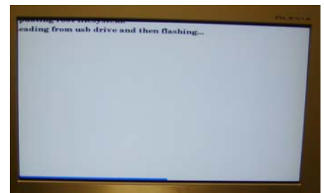
Reading from usb drive and then flashing...